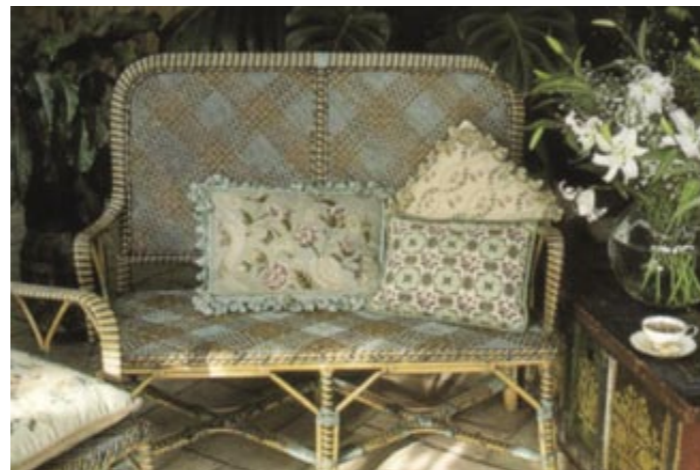
Above and Left: Intricate needlepoint cushions soften the appearance and increase the comfort of pieces of bamboo and cane furniture, which can appear (and feel!) rather harsh on their own. Romo