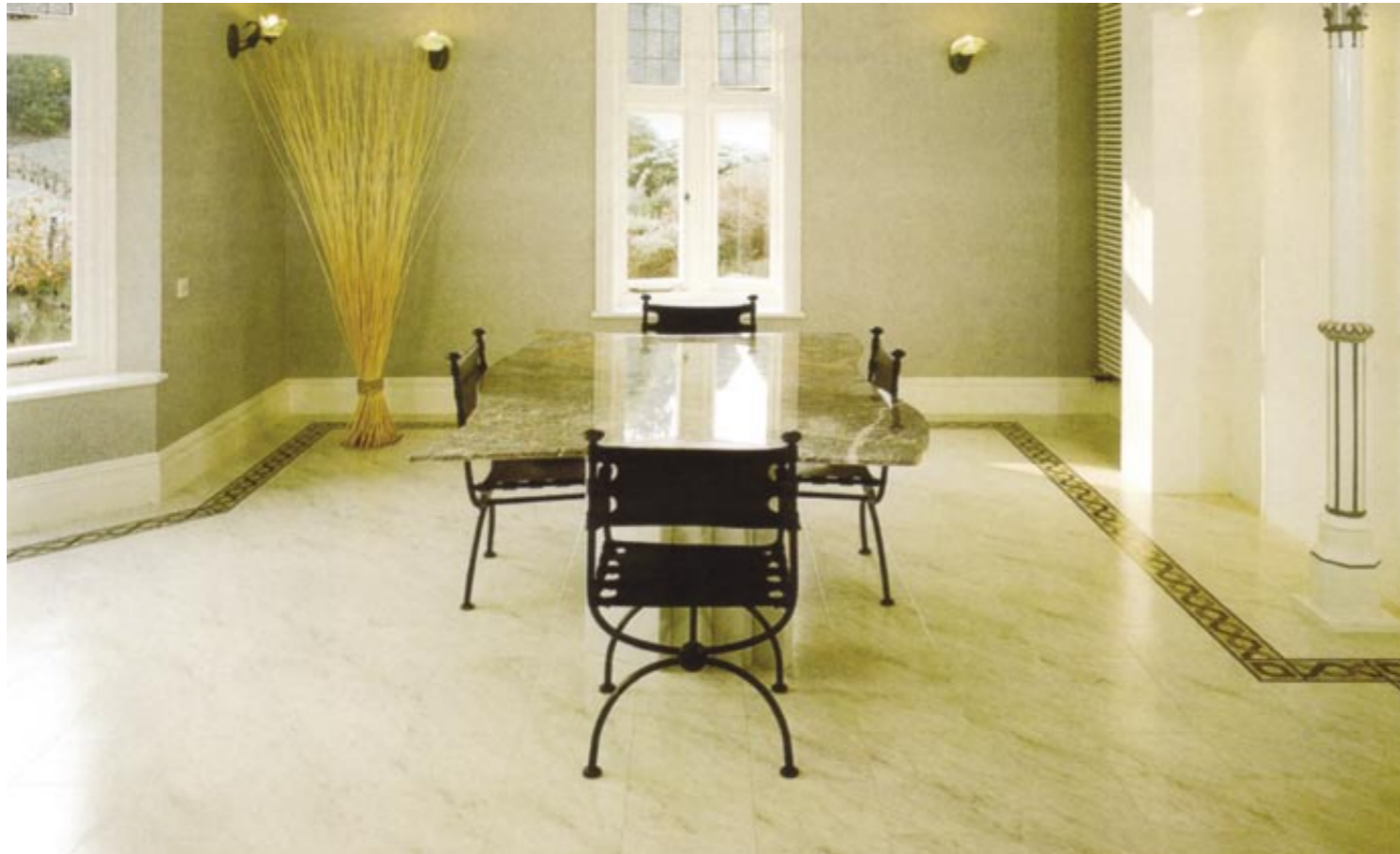
Above: A meeting room in a company headquarters rendered in marble and wrought iron exude an air of elegance and confidence. The Amtico Company Ltd.

mind should both be expanding constantly with thoughts and uses for both old and new materials of all types.